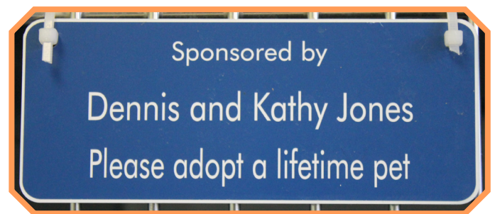
Example of a kennel sponsorship plaque